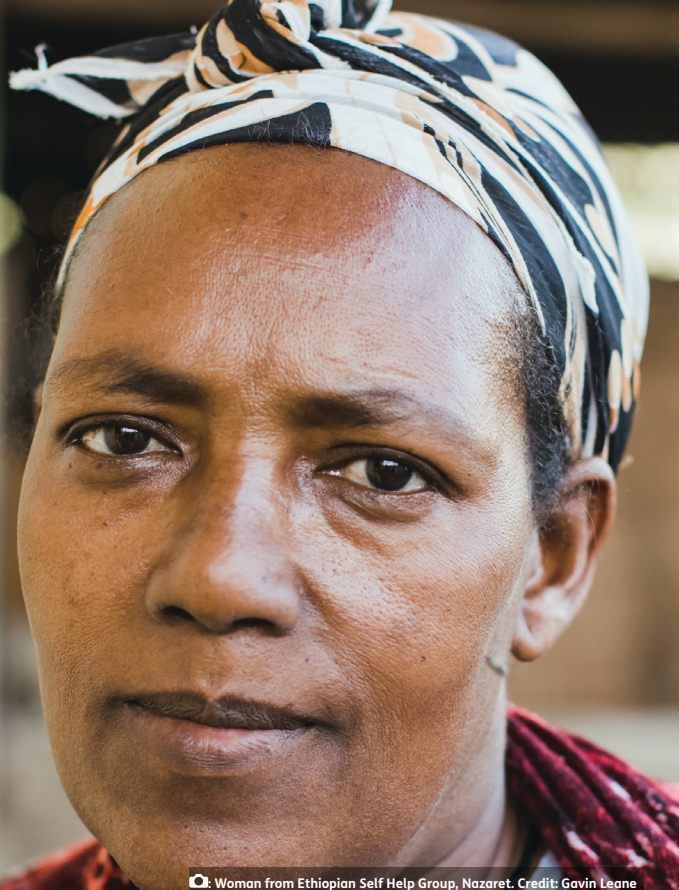
Woman from Ethiopian Self Help Group, Nazaret.