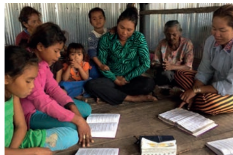
Photo: The Cambodian Hope Organisation (CHO) is using Church and Community Mobilisation (CCM) to serve some of the poorest communities in Cambodia. Tearfund

In Cambodia, another group of churches are excited to see how God is working in and through them to transform their communities.