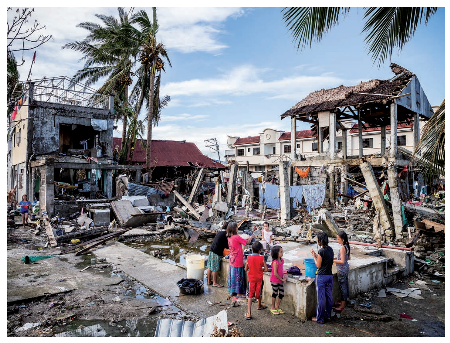
The town of Basey in Samar, the Philippines, was destroyed by typhoon Haiyan in 2013.