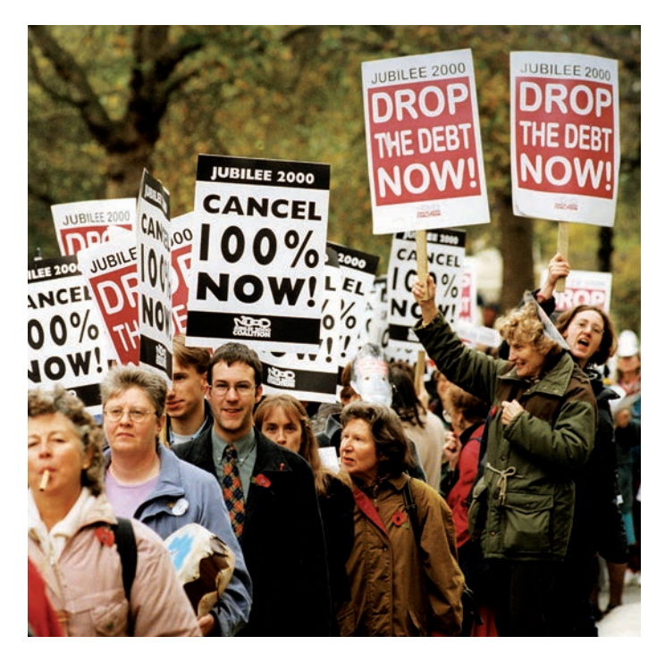
Debt campaigners take to the streets of London with Jubilee 2000 .

What we need are stories that help people and societies to make sense of where they are, how they got there, where they are trying to get to and how to achieve change. Stories that define our worldview and have the potential to create our reality as much as they describe it. Stories like Jesus' parables or the ones that Churchill told Britain in 1940. Stories that marry unflinching realism, a profoundly hopeful vision of the future and, above all, a deeply energising view of what people are capable of.