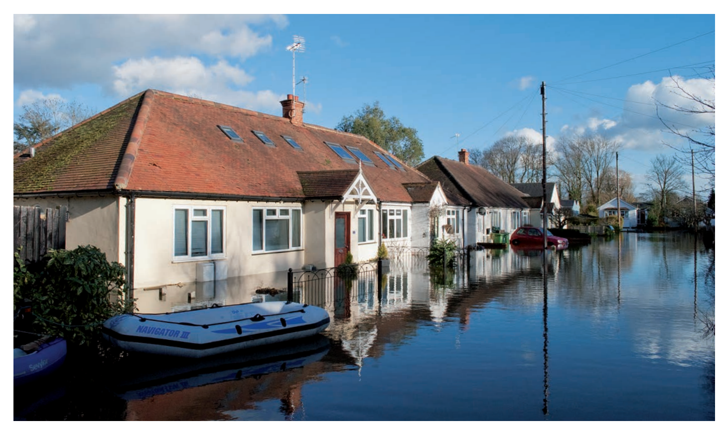
Flooding from the Thames in Lower Sunbury in February 2014 – Britain's wettest winter for more than 200 years.