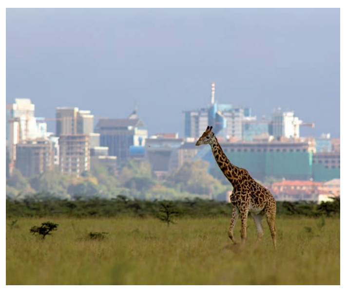
Nairobi's ever-changing skyline reflects economic growth, creating jobs and helping people to escape poverty.

We believe that the present golden age can be extended to everyone, and to future generations. But our present path will not take us there: instead, it will lead ultimately to the collapse of planet earth's life support systems with countries and communities fragmenting. Unless we change course, we will undo all that we at Tearfund, our supporters, our partners and, above all, poor people across the world have worked so hard to achieve.