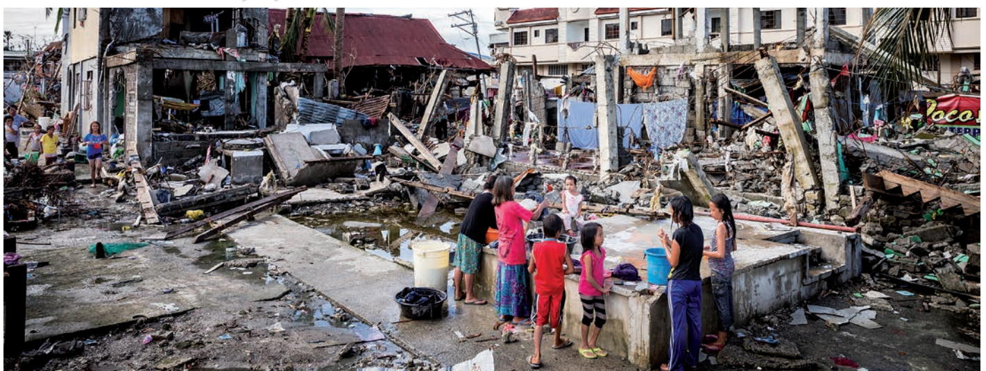
The town of Basey in Samar, the Philippines, was destroyed by Typhoon Haiyan in 2013.

“Another, narrower path leads to a place where poverty is eliminated, where catastrophic climate change is averted, and where all human beings have the chance to flourish”