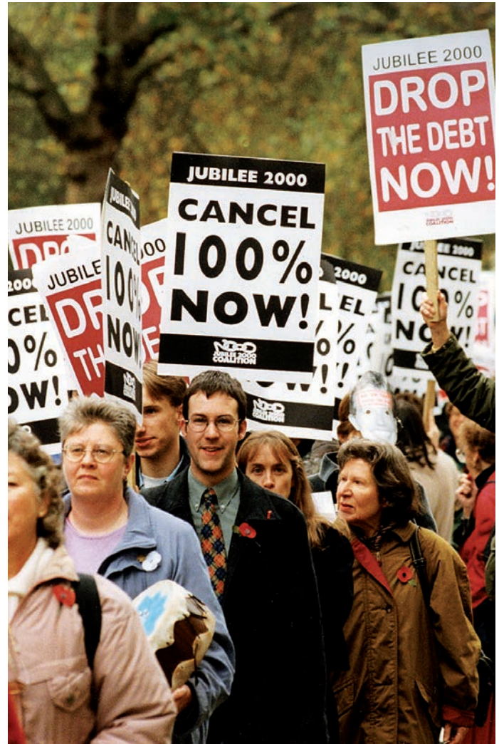
Debt campaigners take to the streets of London with Jubilee 2000 .

When humans act with wisdom, on the basis of steadfast love and justice, they act in ways that accord with the unity and wholeness of creation (shalom). But the bonds of this crucial web of relationships can unravel as a result of what the Bible calls 'iniquity' – for example, through idolatry (worshipping things rather than God), injustice or ignorance. When that happens, the result is catastrophic damage: as Isaiah puts it, 'The earth dries up and withers' (Isaiah 24:4).