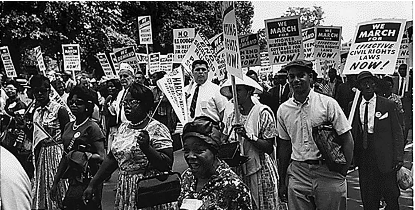
The civil rights movement in the US helped transform public attitudes on racial discrimination.

As Tolstoy says in War and peace , 'It's hard to thank any single individual for altering history; more often, the ship of state alters course only because tides are vastly shifting underneath.' As we look to the future, we believe one of the most important roles that we and other Christian development NGOs can play is to help shift those tides. The changes that need to happen now are at the level not just of policy change but of the wholesale transformation of lifestyles, institutions and systems. We think churches are central to this endeavour, given their scale and reach. 50 And as we set out in this chapter, we think this involves a far-reaching change in values, building a grassroots social movement on a much bigger scale than anything we've seen in recent years, and being ready for the moments of opportunity that come after shocks.