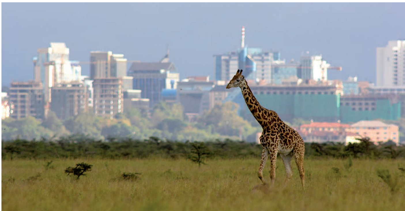
Nairobi's ever-changing skyline reflects economic growth, creating jobs and helping people to escape poverty.

'It was the best of times, it was the worst of times, it was the age of wisdom, it was the age of foolishness, it was the epoch of belief, it was the epoch of incredulity, it was the season of Light, it was the season of Darkness, it was the spring of hope, it was the winter of despair, we had everything before us, we had nothing before us, we were all going direct to Heaven, we were all going direct the other way...' Charles Dickens, A tale of two cities